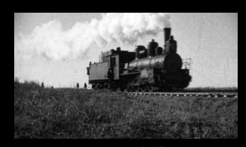
TURKSIB AT HELLENS p. 13, 25 A visually stunning Soviet epic accompanied by a wonderful live performance at historic Hellens