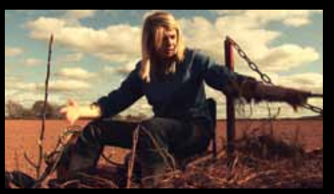
TUNE FOR THE BLOOD (PG) AT LYDE COURT BARN p.10, 24 Another chance to see one of the hits of Borderlines 2012. In a barn with a meal