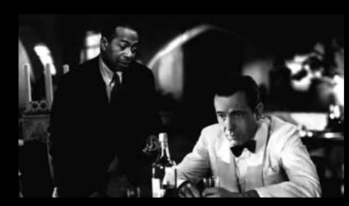
PLAY IT, SAM p.8-9, 18 Casablanca in a sparkling new print