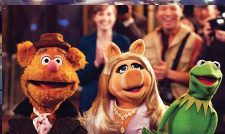
1 Casablanca / 2 A Matter of Life and Death 3 A Bridge Too Far / 4 The Muppets