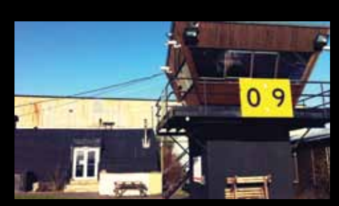
THE SKY'S THE LIMIT p.8-9 Trial flights and a rolling film programme in the WW2 hangar at Shobdon Airfield