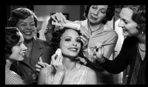
THE ARTIST (PG) p.7, 15 ...returns with Oscar and BAFTA laurels for an open air screening at Berrington Hall