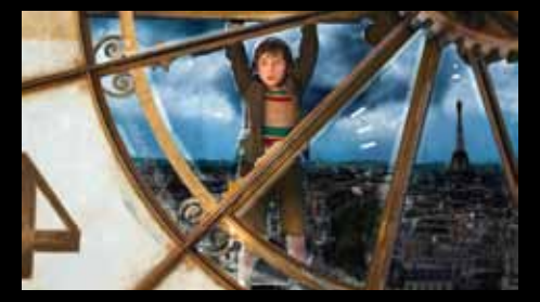
HUGO (U) p.19 Scorsese's Oscar-winning family fantasy reels you into the magic of early cinema showmanship