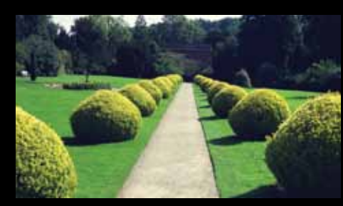
BIG SCREEN AT BERRINGTON HALL p.6-7 Films under the stars in a magnificent outdoor setting