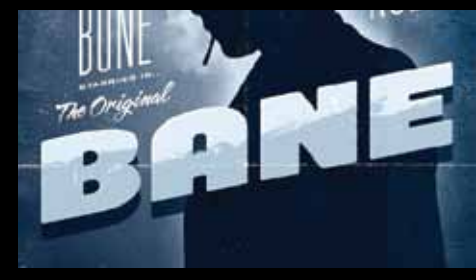
FILM STAND-UP p.12 Film noir performance Bane 1 and 2 at Goodrich, 10 Films With My Dad at Leintwardine