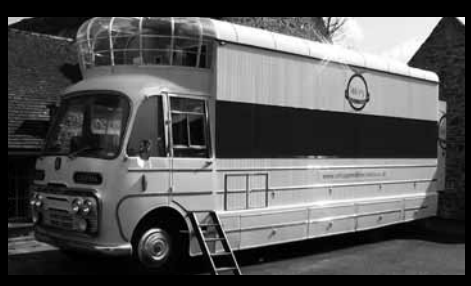
CIDER WITH MOVIES p.11 The Vintage Moviebus returns, this time to The Big Apple's Blossomtime in Putley